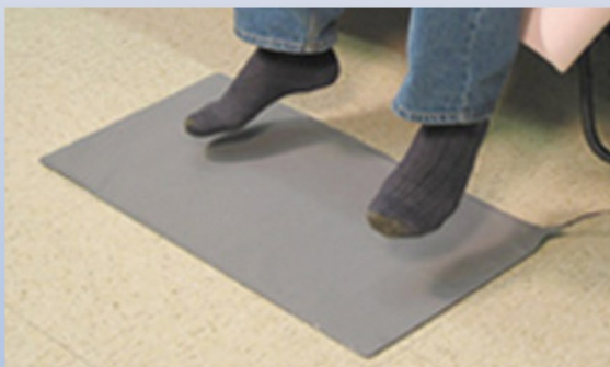
Floor Mat Sensor Wander Management