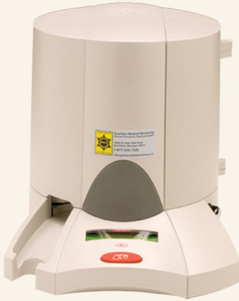
Medication Organizer Remind, Track & Dispense