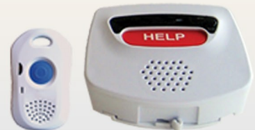
2-way Voice Pendant & HELP Speaker Button Caregiver Connect PERS accessory