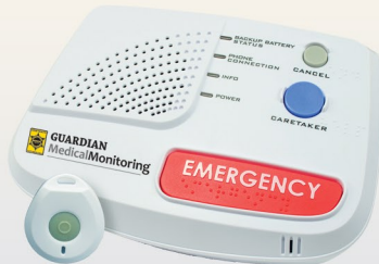
Personal Emergency Response System with Caregiver Connect