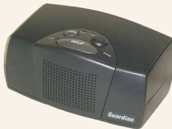
Personal Emergency Response System with Reminders