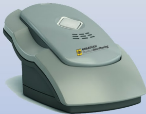
Mobile Personal Emergency Response with GPS