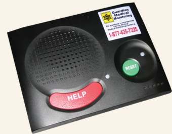
Personal Emergency Response System No landline needed!