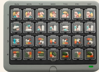
Medication Organizer Remind & Track