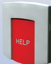
Wall Mounted Help Button PERS accessory, alarm transmitter