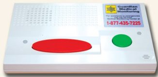
Personal Emergency Response System