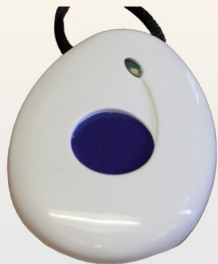
Personal Emergency Response System with Fall Detector